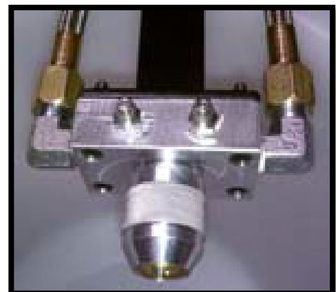
Above: Aluminum Wand Tip

For more information please email us at: