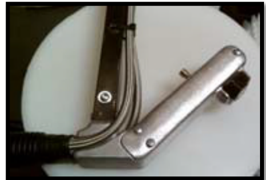
Above: Flow Control Dispensing Wand